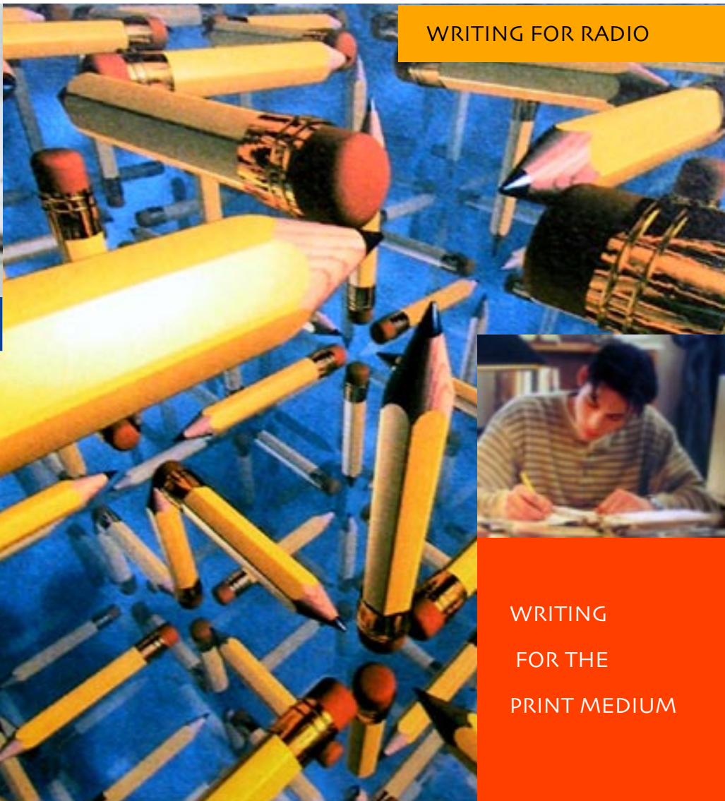
WRITING FOR RADIO