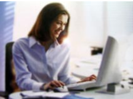
WRITING FOR TELEVISION